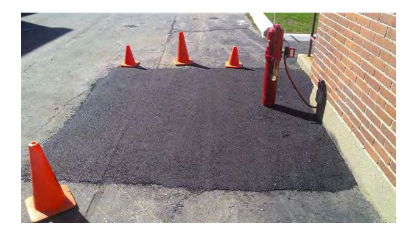
URAM Excavation Area 1 Paved