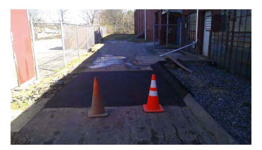
URAM Excavation Area 2 Paved