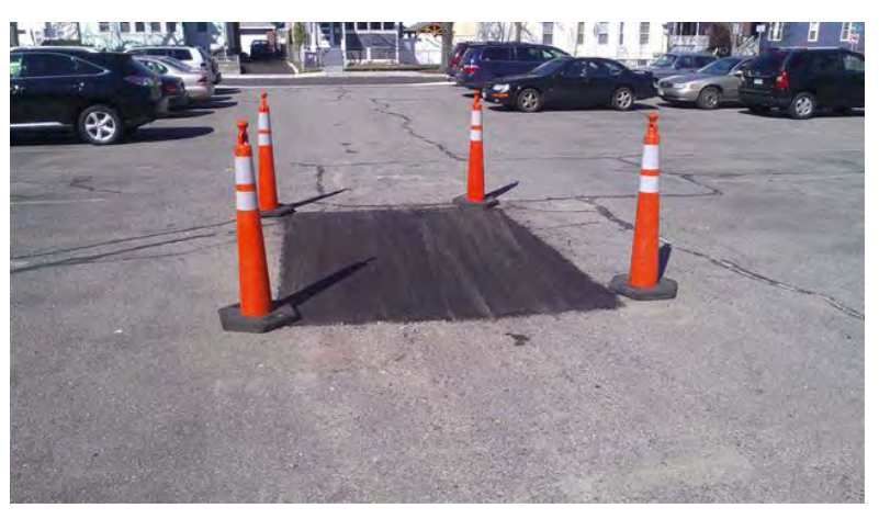
URAM Excavation Area 3 Paved