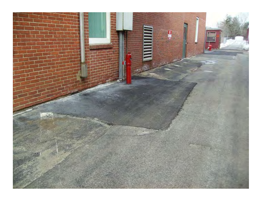
URAM Excavation Area 2