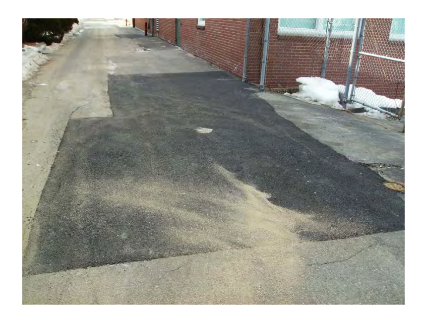
URAM Excavation Area 1