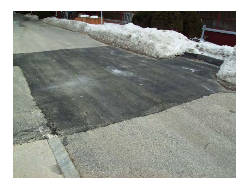
URAM Excavation Area 3