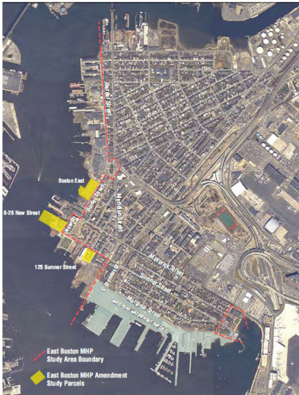
Figure 1. East Boston Planning Area