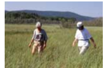
Kamponsa Bog Drainage Basin ACEC

The environmental inventory is the foundation upon which the rest of the plan is developed.