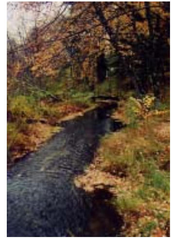
Westboro Cedar Swamp ACEC

Weymouth Back River ACEC Natural Resource Inventory , 1996, DEM.