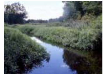
Hockomock Swamp ACEC

Technical information should be supplemented by surveying public perceptions and professional observations. Ultimately, all of this information will be synthesized and evaluated in order to identify issues, create management strategies and policies, and develop recommendations. The contents of a resource management plan are described below in more detail.