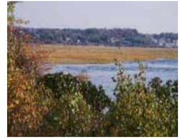
Rumney Marshes ACEC

Consultation with ACEC Program staff is strongly recommended.