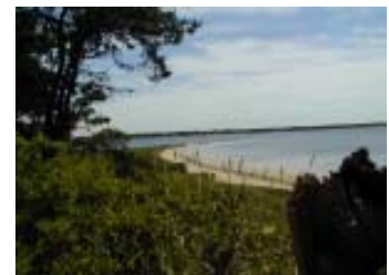
Waquoit Bay ACEC

For waterways publications, see the DEP website at www.state.ma.us/dep/brp/waterway/wspubs.htm