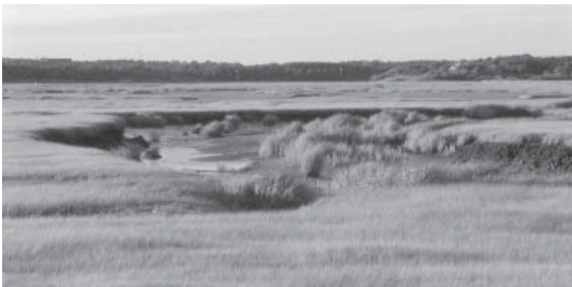
Wolflleet Harbor ACEC

The basic approach of any resource management plan is to inventory, analyze, recommend management strategies, and implement actions. ACEC Program staff are available to provide information and guidance throughout the planning process.