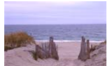
Pleasant Bay ACEC

Identify specific projects to achieve early successes, garner support, and establish momentum.