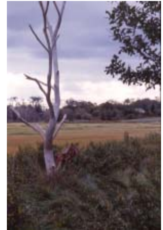
Inner Cape Cod Bay ACEC