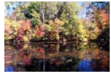
Miscoe-Warren-Whitehall Watersheds ACEC

First define the goals and objectives of the planning process.