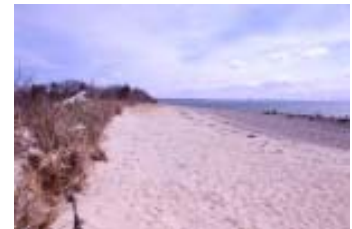
Ellisville Harbor ACEC

To achieve its purpose, a resource management plan must present a thorough explanation of existing conditions; past, current and future trends; an assessment of key problems and threats; and workable strategies to address these problems. It must also show how the community intends to play a role in the success of the strategies. Much of the planning is community based, with local and regional goals and objectives guiding the plan. Accomplishing