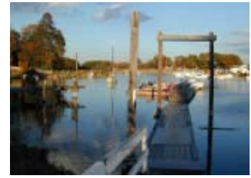
Parker River/Essex Bay ACEC

A state-approved ACEC RMP should also assess multiple water-dependent issues and activities. These might include public access, boating, aquaculture, and dredging. Regarding dredging, it is important to point out that 310 CMR 9.40 (1) (b) provides limitations on dredging and dredge disposal activities in an ACEC. Projects shall not include: (1) improvement dredging except for the purpose of fisheries or wildlife enhancement; and (2) dredge material disposal except for beach nourishment, dune construction or stabilization or enhancement of fisheries or wildlife resources. Although this regulation regarding improvement dredging and dredge material disposal is not changed by a state-approved RMP, any issues regarding these activities should be identified in the RMP.