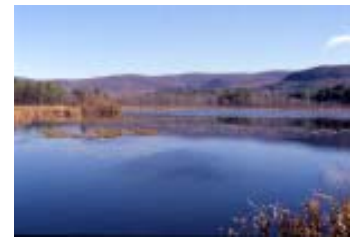
Karner Brook Watershed ACEC

Prioritize recommendations to ensure that support and funding are directed to actions that offer the greatest benefit.