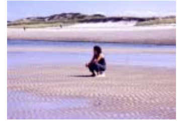
Sandy Neck/Barnstable Harbor ACEC

Recommendations and Priorities: From the analysis, the planning committee will develop recommendations about actions needed to protect or restore the resources and policies to guide future decision-making. Public outreach should be used to gather comments about priorities and issues, to help develop practical management solutions, and to educate the community and gather their support. Recommendations will focus on the goals of the plan and can address future outreach, monitoring, research, restoration, public open space and access, and regulatory changes. Each recommendation can be evaluated based on a certain set of criteria, which can include urgency, feasibility, relative benefit and cost estimates, timeframe, permitting needs, partners, and public support. Prioritizing recommendations and actions based on the criteria will ensure that support and funding are directed to the actions that offer the greatest benefit.