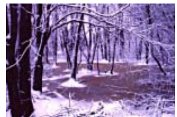
Fowl Meadow and Ponkapoag Bog ACEC

Information important to developing a plan can be found in a variety of other planning projects and documents.